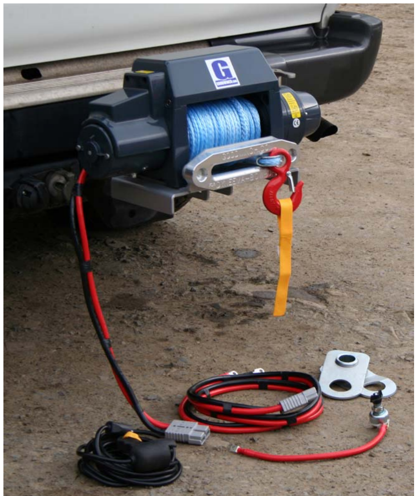
TDS-9.5i mounted on the largest of our portable Bak-Rak units with Dyneema® Bowrope, aluminium hawse and vehicle wiring harness with quick disconnect fittings @ £599 + VAT

Even a picnic or work table can be installed in a jiffy. In fact, the list is endless, there must be a limitless number of things you can hang on a tow ball, wherever it is fitted!