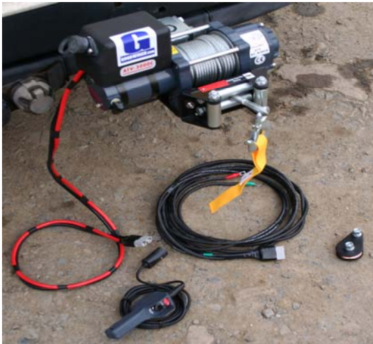
Bak-Rak mounted TDS ATV/GP3000 c/w vehicle harness & quick disconnect fittings. £279 + VAT