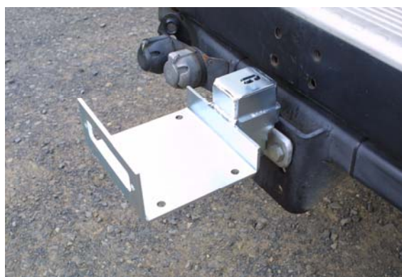
The medium sized version for 6" wide short drum winches up to 6,000lbs @ £49 + VAT