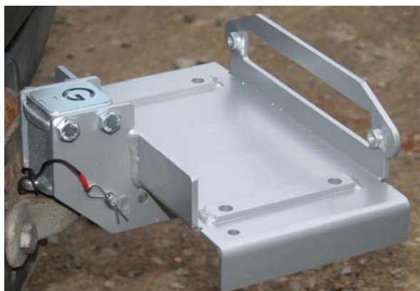
This larger version is designed for most 9,000lb winches @ £59 + VAT