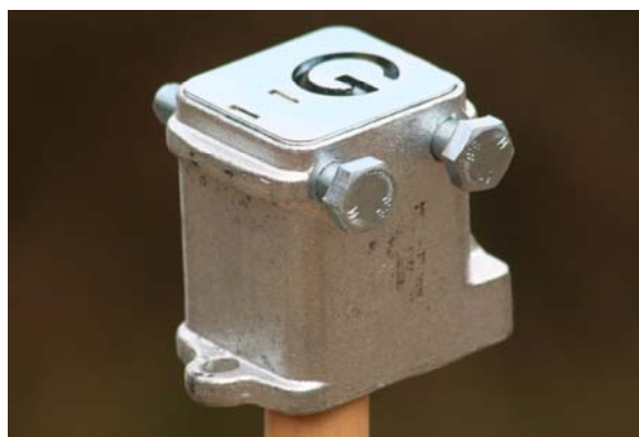
The Bak-Rak Casting and Clamshell @ £19 + VAT

As most of our business is UK and European 4x4 dealers and overseas sales, all prices are plus carriage and VAT.