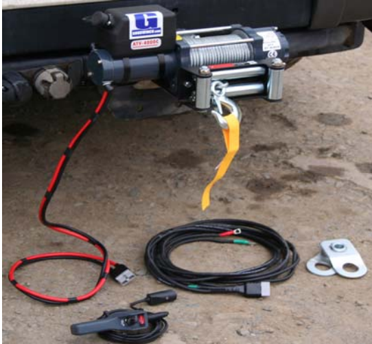
Bak-Rak mounted TDS ATV/GP4000 c/w vehicle harness & quick disconnect fittings. £299 + VAT

For instance, you could install a tow ball at the top of a ramp, driveway or slipway to winch up dead vehicles, caravans or boats on trailers.