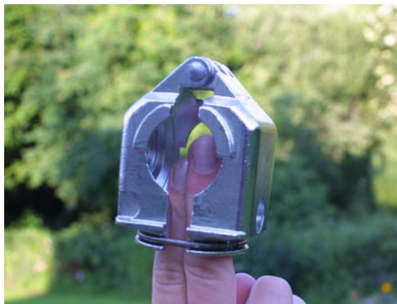
The unique bak-rak 'Clam Shell' which allows for all sorts of units to be easily installed

When the winch mount is installed, a ready made up for the vehicle wiring harness is supplied with quick disconnect fittings.