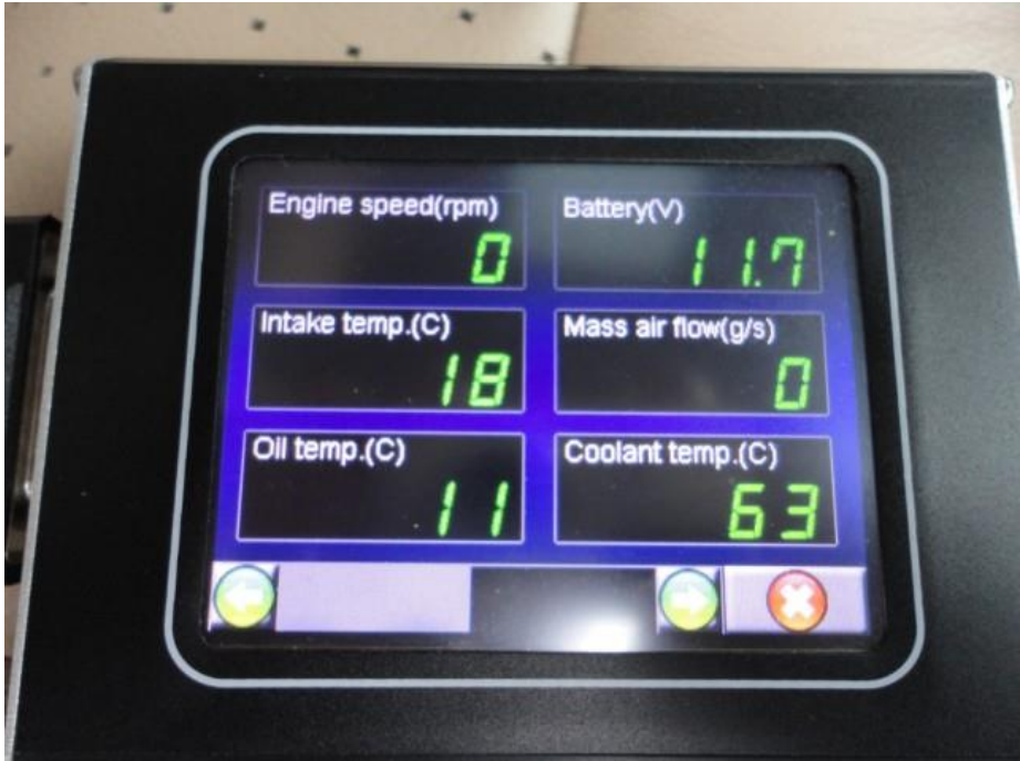
Shut down – run time 22 mins