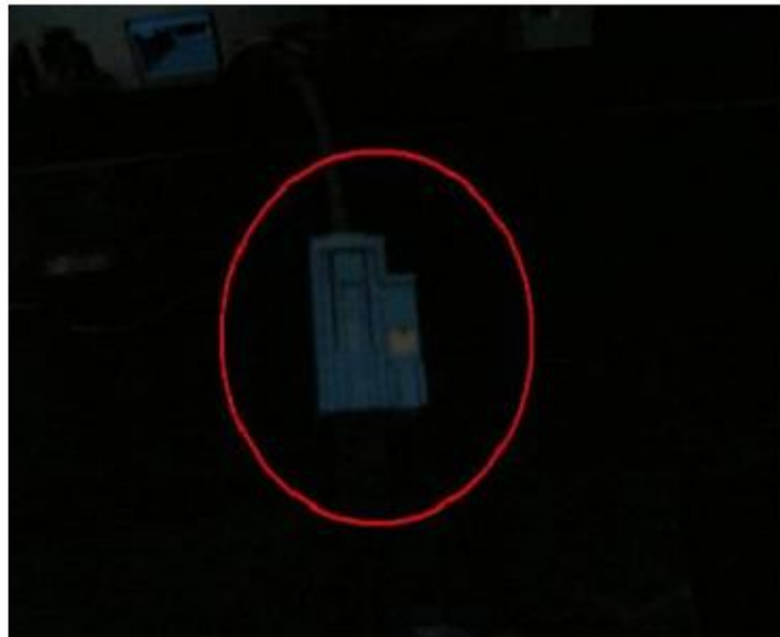
STEP 2: Separate Original cables.