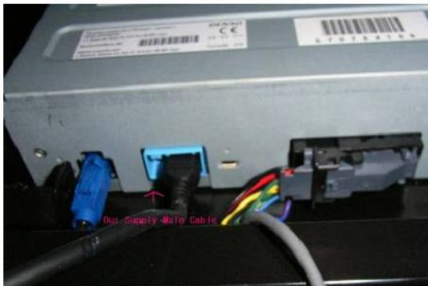
STEP 3: Connect Our Supply IN Cable to the navigation Box. Connect Our Supply IN Cable to GVIF IN at the VGA Interface.