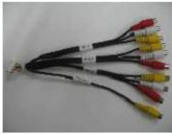
AMP 10 Pin Female Cable