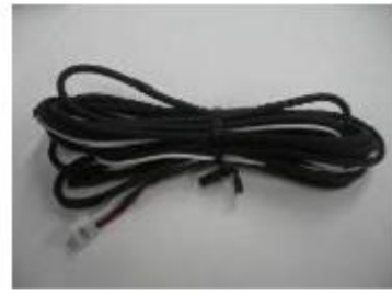
Remote receive Module Cable