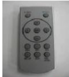
Remote Control Unit