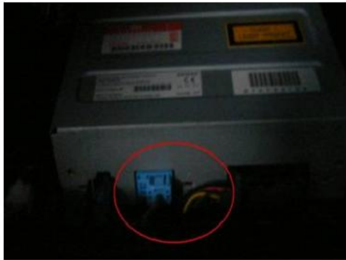
STEP 1: Find out the navigation box under the driver's seat.